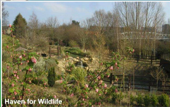
Haven for Wildlife