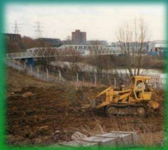
Derelict Coal Yard